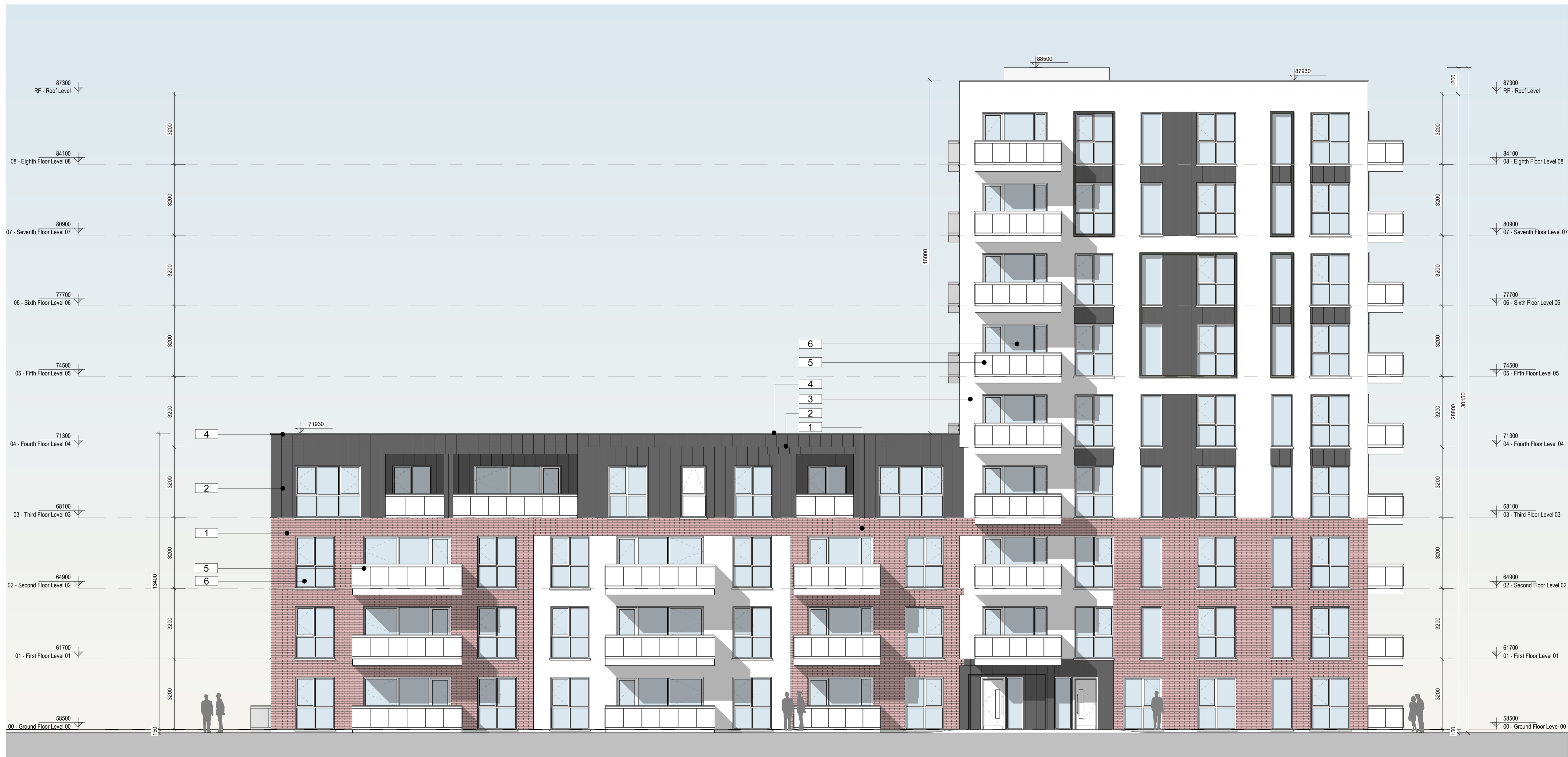
1 South Elevation 1 : 100

Please consider the environment before printing this sheet